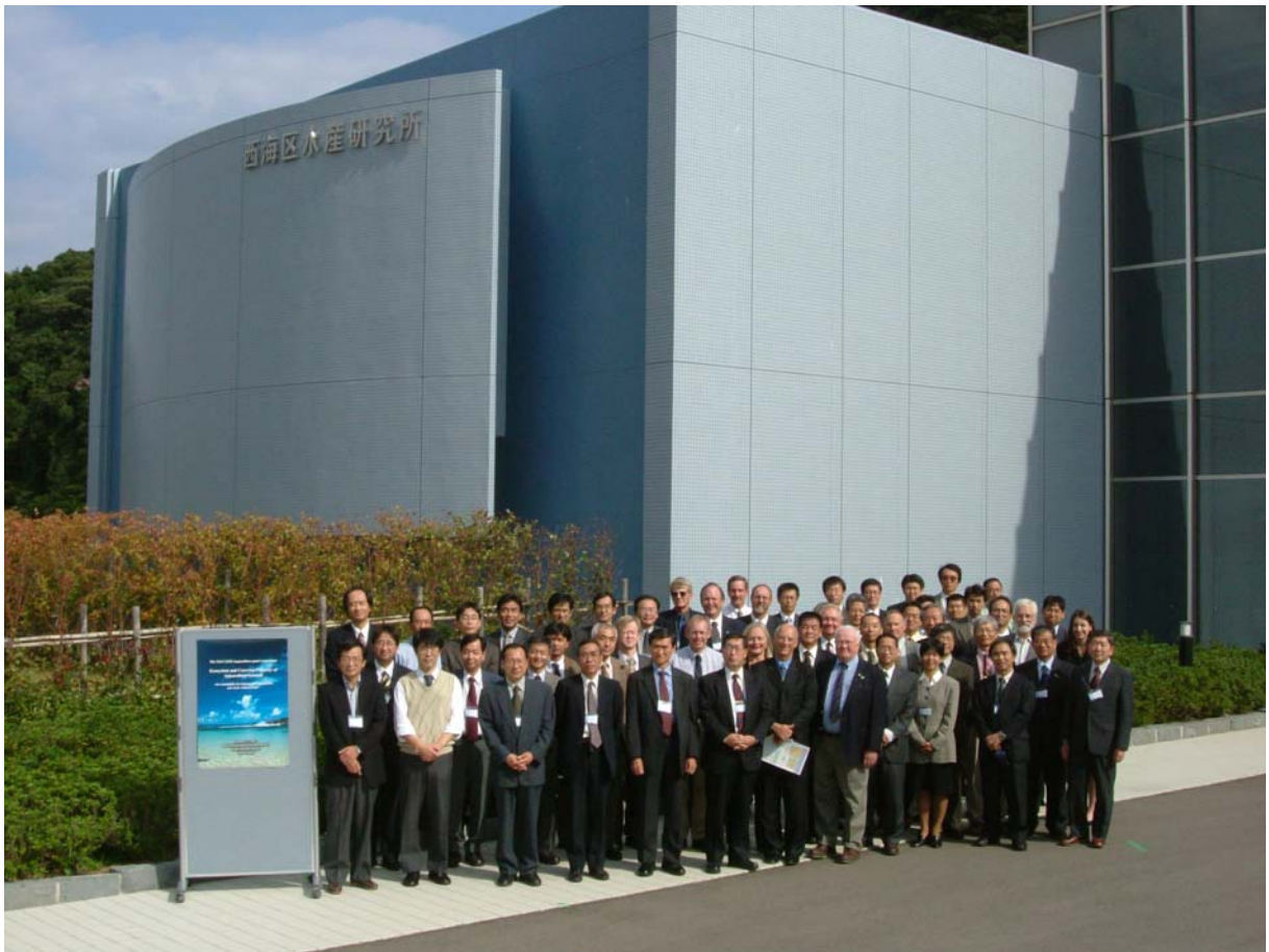
シンポジウム参加者 (西海区水産研究所) 2004.11.3